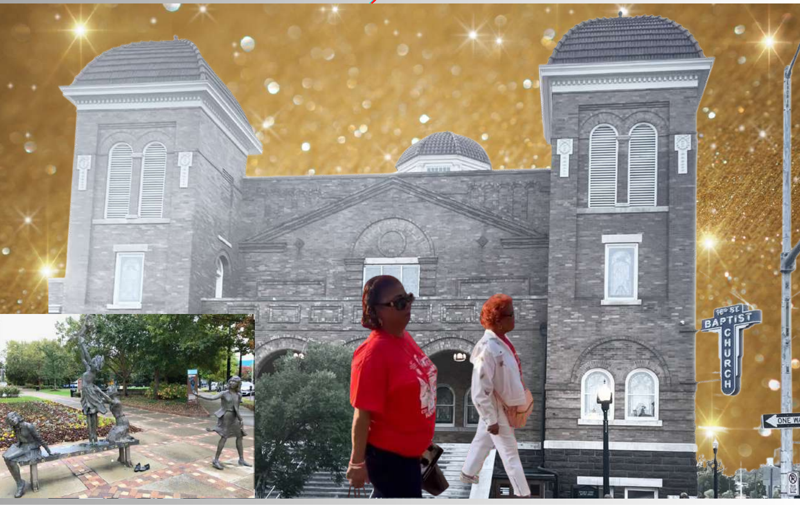
Expected Attendance: 300

Be a part of an exciting opportunity to sponsor the Friday Night City Excursion where Charmettes, Charmers, Camp Charm Registrants, and Guests, explore the city's landmarks, rich history, and indulge in local cuisine. As a sponsor, you will have the chance to showcase your brand to a diverse group of individuals who are passionate about experiencing the host city's culture. Your logo will be prominently displayed on all promotional materials, including flyers and social media posts. By joining hands with us, not only will you be supporting a fun and educational experience for our attendees, but you'll help spread the word about this amazing organization to the city. Don't miss out on this chance to promote your brand. Contact us today to learn more about sponsorship opportunities for the Friday Night City Excursion.