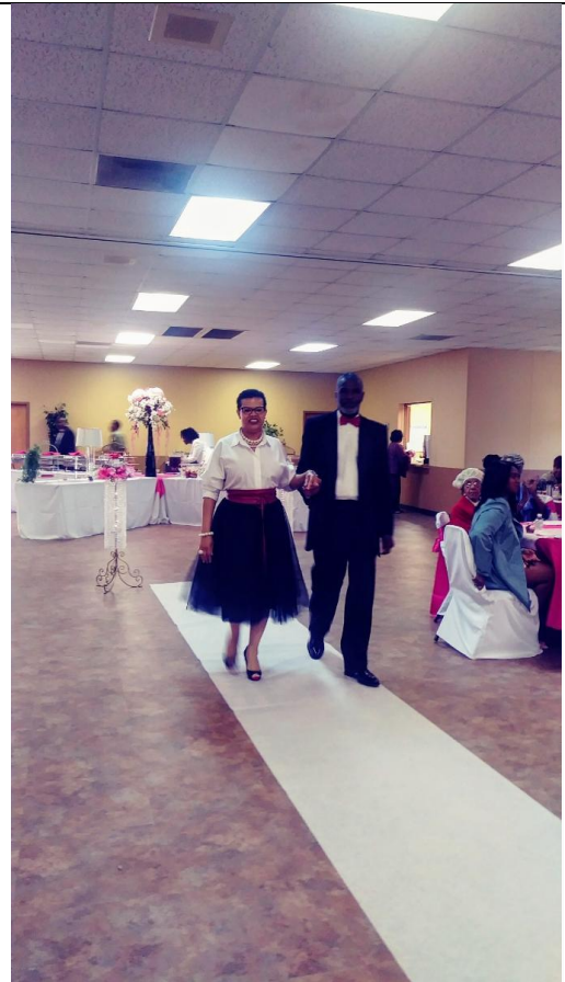
Cancer Survivor being escorted at The Memphis Metropolitan Prayer Bruch April 2019.