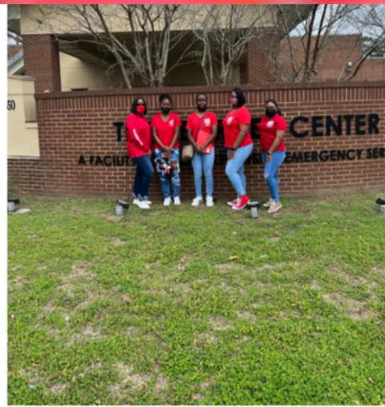
Junior Debs at the homeless shelter.