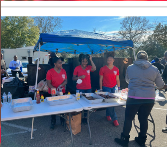
Junior Debs doing good work while fostering fellowship on MLK Day.

Several of our young Junior Debutantes took times to make a difference during the Community Clean Up event, hosted by the Urban League of Tallahassee