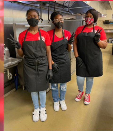
Junior Debs at the homeless shelter.