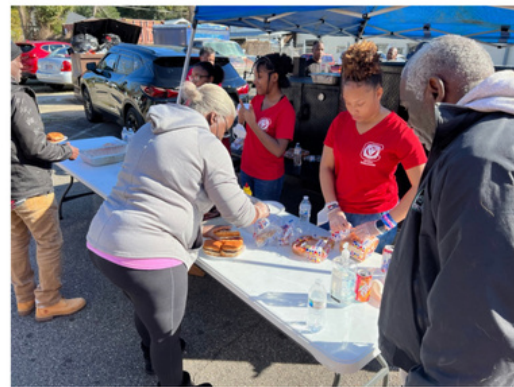
Junior Debs feeding men and women in historic Frenchtown.