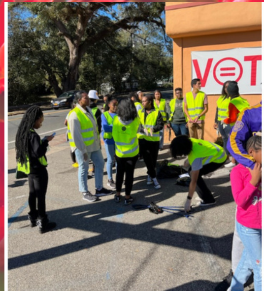
Community Clean Up.

Several of our young Junior Debutantes took times to make a difference during the Community Clean Up event, hosted by the Urban League of Tallahassee